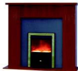
Version D4 + C1

Height - 1104 Width - 1140 Depth - 360 Light - 2 x 40W Wattage - 2 kW Weight - 52 kg