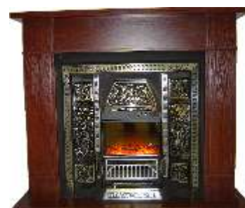
Version D5 + C1

Height - 1220 Width - 1375 Depth - 385 Light - 2 x 40W Wattage - 2 kW Weight - 64 kg