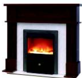
Version D3 + C1

Height - 1104 Width - 1260 Depth - 400 Light - 2 x 40W Wattage - 2 kW Weight - 56 kg