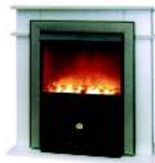
Version D1 + C1

Height - 640 Width - 520 Depth - 200 Light - 2 x 40W Wattage - 2 kW Weight - 17 kg