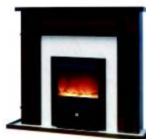
Version D2 + C1

Height - 736 Width - 735 Depth - 330 Light - 2 x 40W Wattage - 2 kW Weight - 40 kg